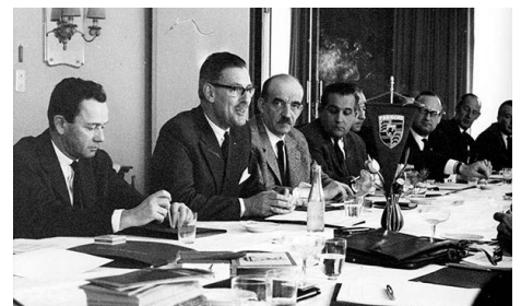
1959: The first Club Presidents meeting led by Huschke von Hanstein and Ferry Porsche