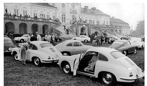
1960: The PCA Tour Stuttgart meeting at the Solitude castle