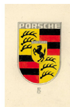
Two originals: Badge of the Westfälischer Porsche Club Hohensyburg and the Porsche crest from 1952