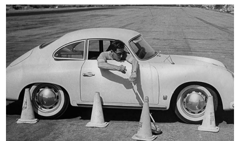
1956: PCA competition challenges at a event in San Diego