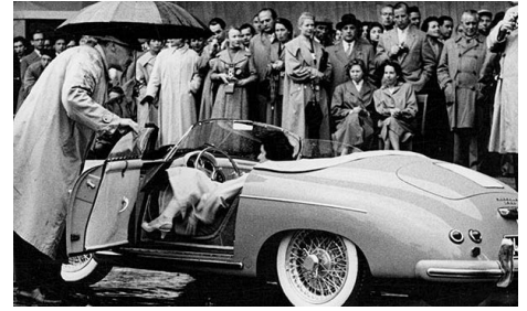
1955: The first international Porsche Treffen in Meran

In the middle of the 1957 motor racing season the Porsche 718/1500 RSK Spyder is unveiled.