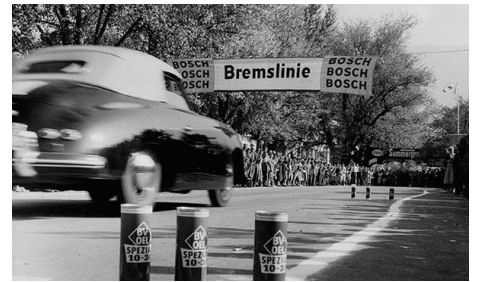
Early Club life: Driving skill trials for Porsche drivers at the Meran Treffen in 1957...