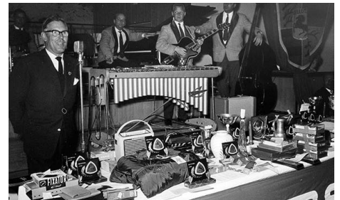
1961: Price giving ceremony at the Zürs event in 1961