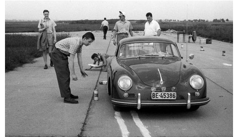
... and at the Austrian capital of Vienna.