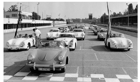
1961: Porsche Club Italia at Monza