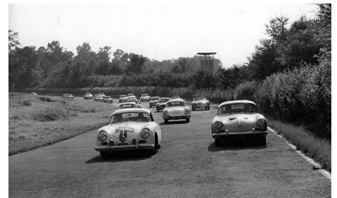
1961: Porsche Club Italia at Monza