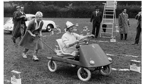
1958: ... and again in Meran. Porsche Clubs are all about driving skills.