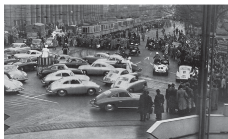
Pioneers: Porsche friends from the Württemberg Club hand out Christmas presents to the Stuttgart traffic police in 1955