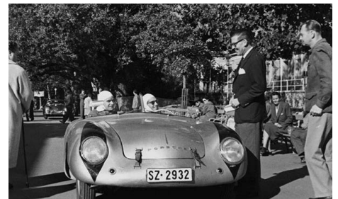
1956: Special guest at Meran: the then private owned 356 Roadster Nr. 1