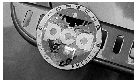
1955: Mark of a new era: PCA's badge in the fiftys