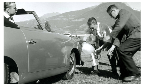
1961: Club Event