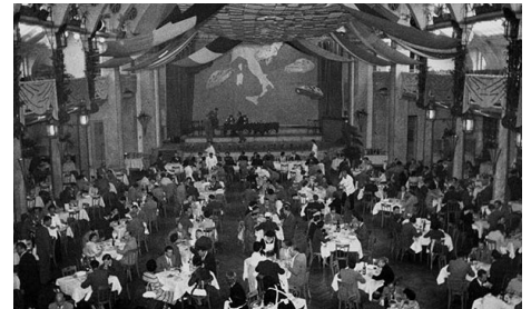
1955: The first international Porsche Treffen in Meran