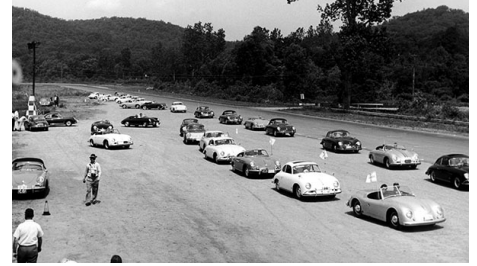
1960: Go West! Porsche Club of America event in Line Rock

The Porsche Club Great Britain is today the largest Porsche Club organisation in Europe, with around 28,000 members . The Porsche Club Great Britain maintains close links with the factory. This is why they organise a visit to the factory twice a year.