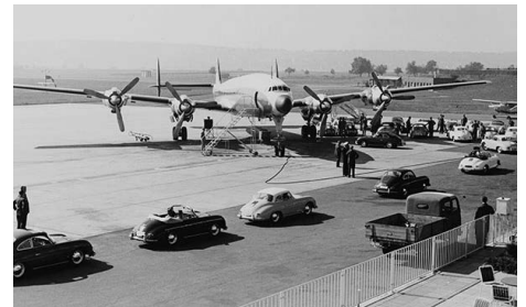
1957: American Club members picking up their vehicles at the Stuttgart airport