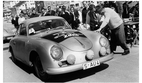
1961: Porsche Treffen Zürs