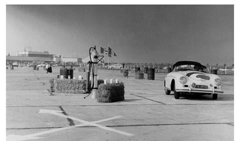
1956: Porsche Club Holland at an event in the town of Knokke