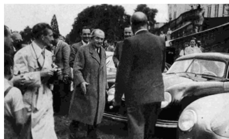
1950: 75th birthday of Prof. Ferdinand Porsche – The first Porsche gathering

After Hohensyburg, more Porsche Clubs quickly spring up throughout West Germany. The Porsche Club Wiesbaden is founded in 1952. 25th of September 1952 sees the creation of the Porsche Stamm Berlin, followed by the associations of the Porsche Club Köln e.V., the Württembergischer Porsche Club e.V. and the Porsche Club Niedersachsen e.V.